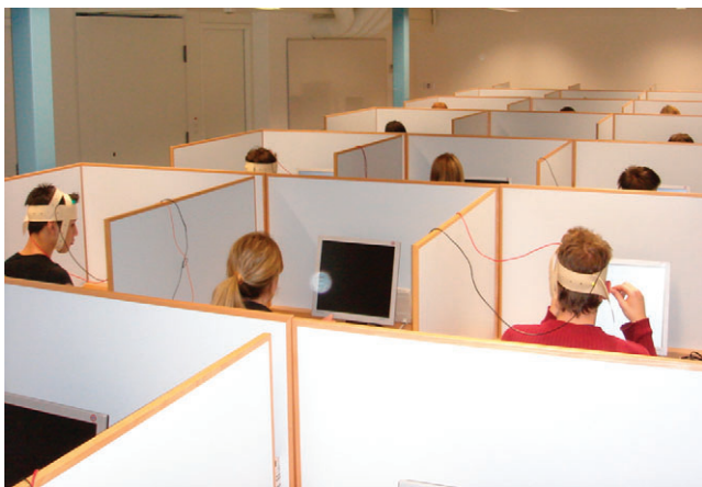
Figure 1. Experimental setting: 12 proposers and 6 responders were in the same laboratory during an experimental session. Responders received tDCS (placebo or cathodal stimulation over the right DLPFC), whereas experimenters sat between each pair of responders to control the tDCS devices.

We conducted the tDCS study with 128 subjects in the role of the proposer (no tDCS) and 64 subjects (all right-handed men) in the role of the responder who received either cathodal (i.e., excitability reducing) tDCS ( n = 30 ) or placebo tDCS ( n = 34 ) to the right DLPFC. During an experimental session (Fig. 1), 6 responders played 12 UGs each with 12 different, anonymous, proposers, that is, each responder “faced” any given proposer only once and was never informed of the bargaining partner’s identity. We deliberately chose 1-shot interactions because no strategic spillovers across periods occur with this structure. This is particularly important if “true” preferences are to be elicited. We can therefore rule out the possibility that the observed rTMS effect is due to induced ignorance of possible reputational effects. The responders had to agree on the division of 20 Swiss Francs (CHF; CHF 1 \approx € 0.65).