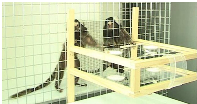
Fig. 1. Experimental setting. A donor, the marmoset on the right-hand side, has the choice between two trays representing the payoff distributions (0,1) (upper tray with a cricket in the left food bowl) or (0,0) (lower tray). The donor pulls the tray with the (0,1) payoff distribution, resulting in a payoff to the recipient on the left side but none to itself.

(0,1) against (0,0) is more difficult because the potential donor does not receive any food for itself regardless of its choice. In the present experiment (Fig. 1), a marmoset donor had a choice between the cognitively simple payoff distributions (0,1) and (0,0), presented on two different trays. We therefore tested for a strong version of unsolicited prosociality in which the relevant spontaneous prosocial tendency must outweigh possible “envy.”